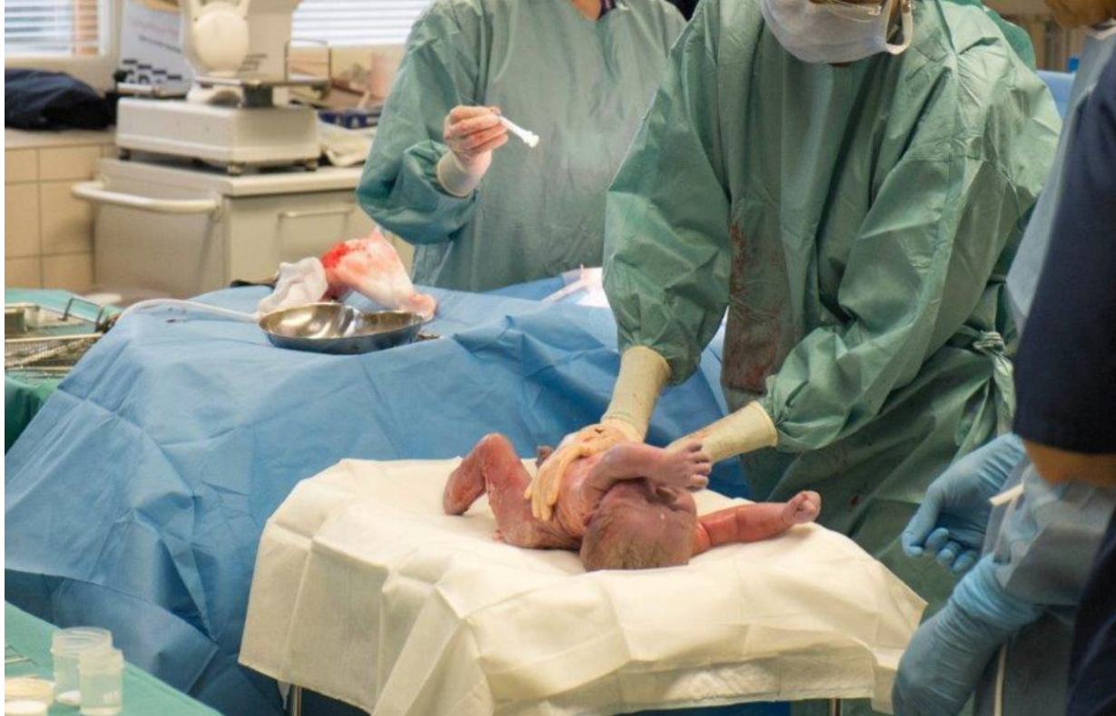
Photo: Brochure Welcome to give birth. Tampere university hospital